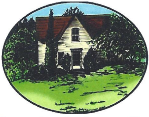
Remember the Corman House