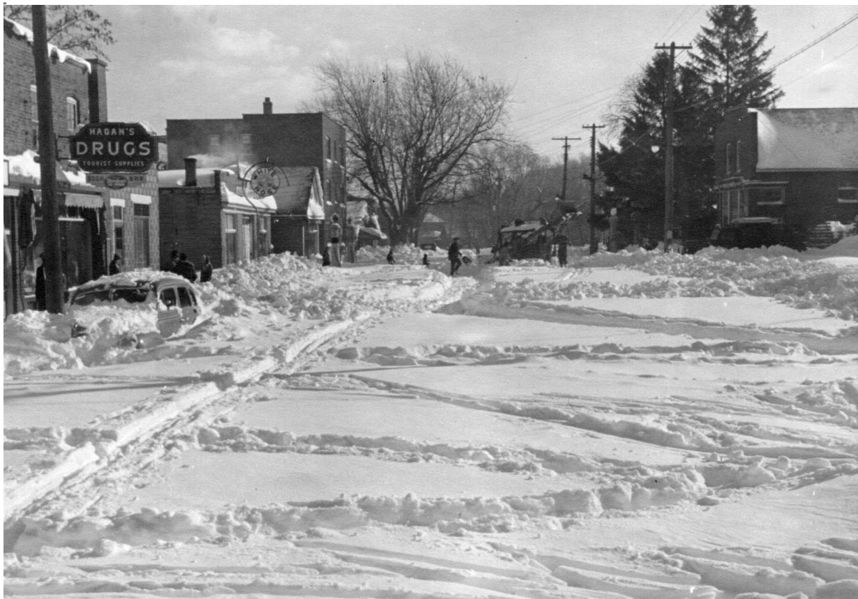
KING STREET STONEY CREEK probably 1944