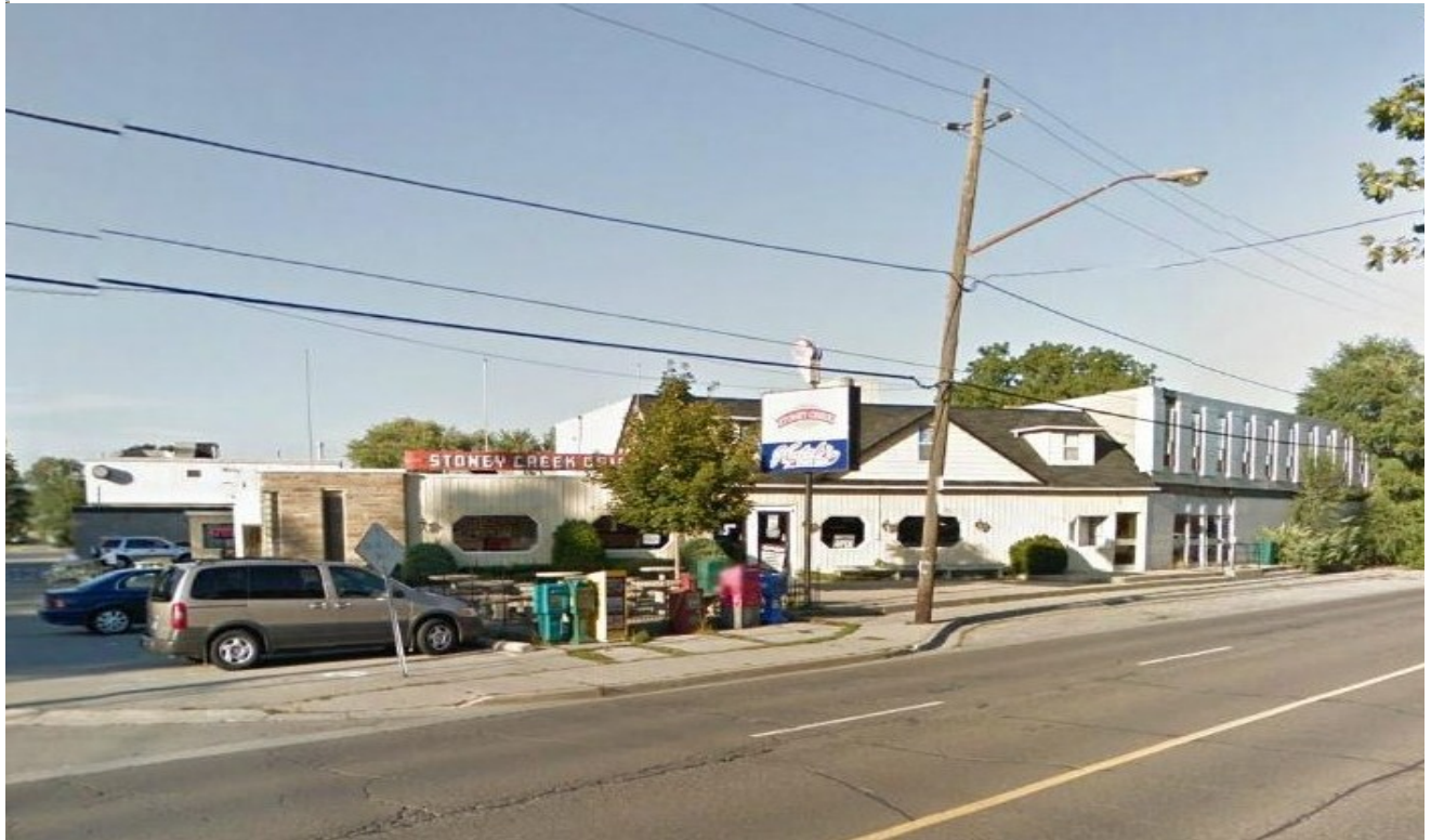
DAIRY SEPTEMBER 2011