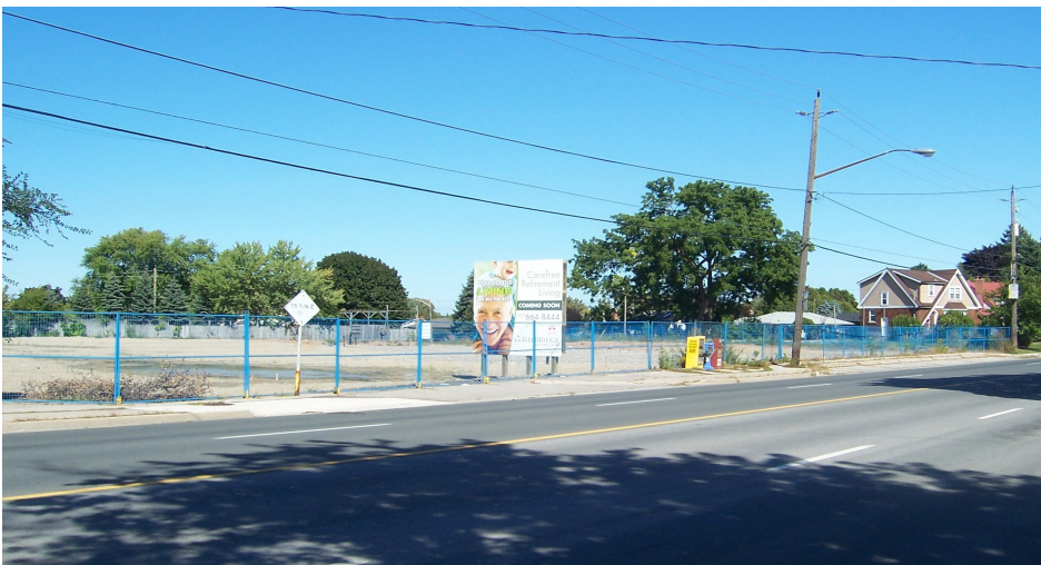
DAIRY SEPTEMBER 2013

ABOVE 2 PICTURES SHOW THE DEMOLITION FROM PASSMORE ST. & THE LAST PICTURE IS FROM KING STREET.