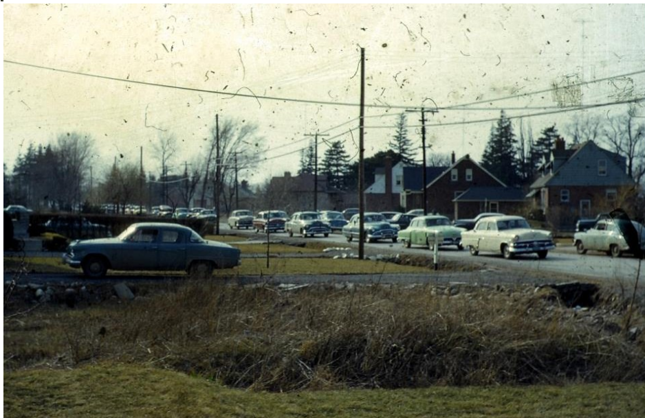
DAIRY IN THE 50'S WITH CARS LINED UP ON KING ST. FOR A SUNDAY TRIP TO THE LEGENDARY DAIRY BAR FOR ICE CREAM