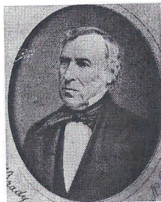
US President Zachary Taylor

Editor's notes: "General Taylor" was Zachary Taylor, in fact the 12 th President of the United States. A War of 1812 veteran and hero of the 1848 Mexican-American War, he died in office on July 9, 1850.