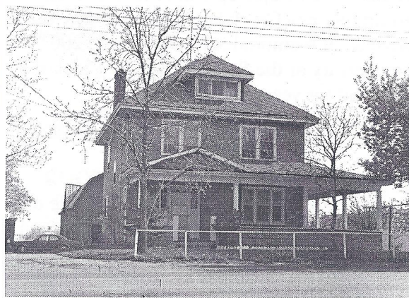
337 Barton Street, c.1975