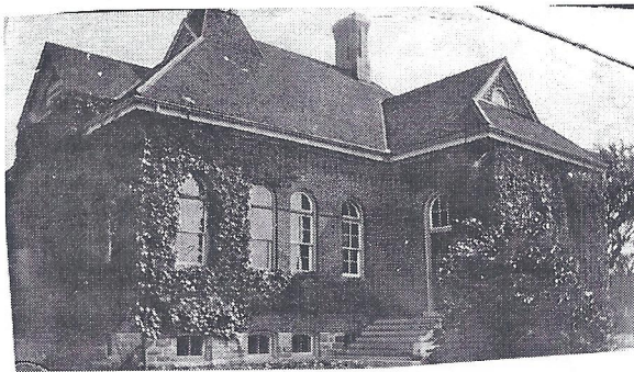
Van Wagner's School, 1924