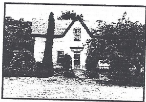
Remember the Corman House