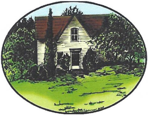
Remember the Corman House