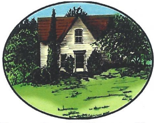
Remember the Corman House