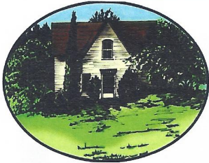
Remember the Corman House