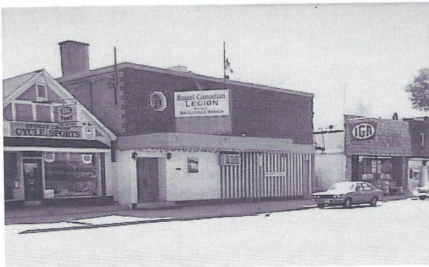
The Legion later took over the cycle store and squared off the building to it's present shape.

Stoney Cycle & Sports, Royal Canadian Legion which took over the Fox theatre circa 1973, next to them is Clark's IGA.