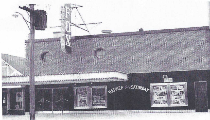
Fox theatre with the first 2 movies the writer remembers seeing were "The Red Skies of Montana" and "Wait Till the Sun Shines Nellie" both 1952 releases.

Stoney Cycle & Sports, Royal Canadian Legion which took over the Fox theatre circa 1973, next to them is Clark's IGA.