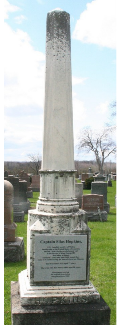
Top left picture of old pioneer cemetery in rural Dundas ( see story details next page )