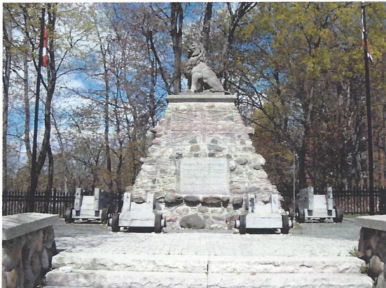
(Above) Smith's Knoll Monument (Below Right) King Street Property for Sale