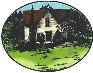
Remember the Corman House