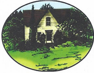
Remember the Corman House