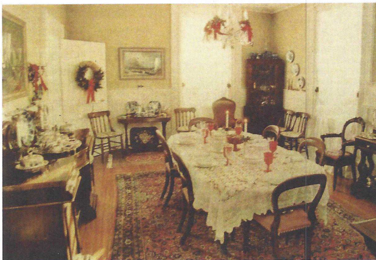
Dining Room table set for Christmas