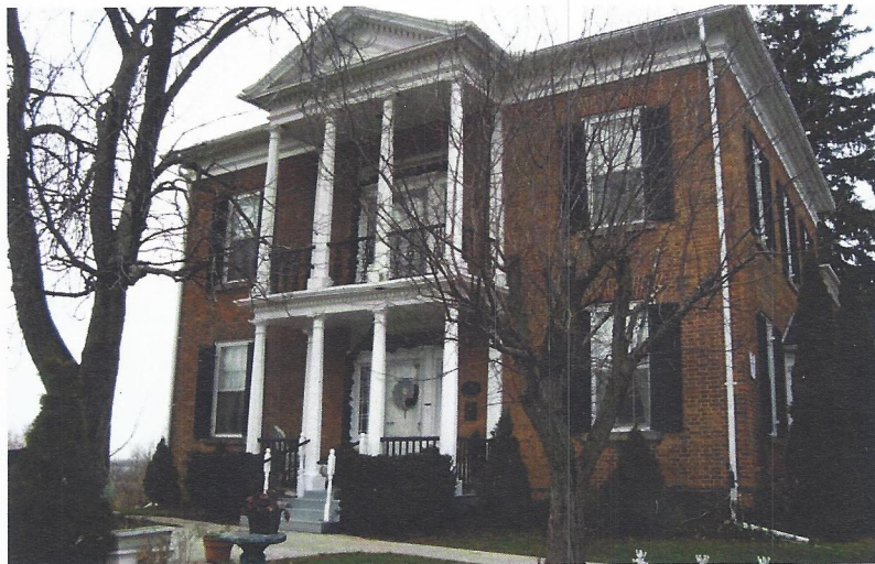
Lewis Home at 169 years – (December 2012)

Many members will remember the highly successful Christmas House Tours, community sponsored for the benefit of our Society. Although the tours are no longer, we are very pleased to once again feature the Lewis House of Winona on pages 1 and 2 of this newsletter.