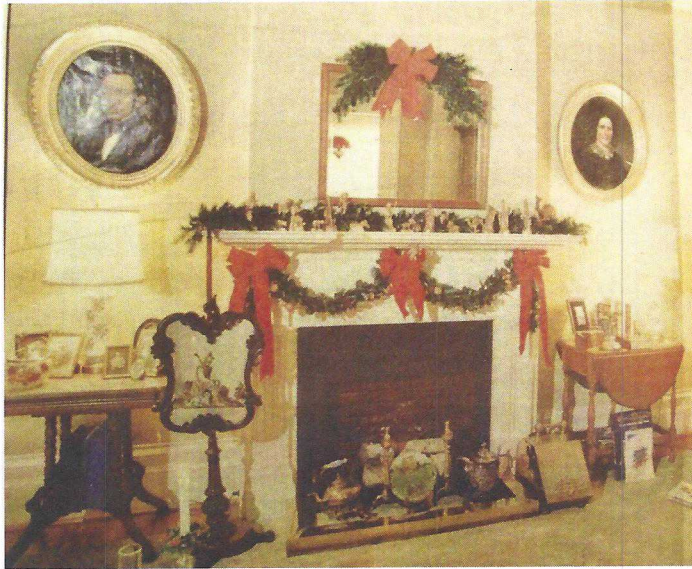
Garlands and Nativity scene adorn living room fireplace