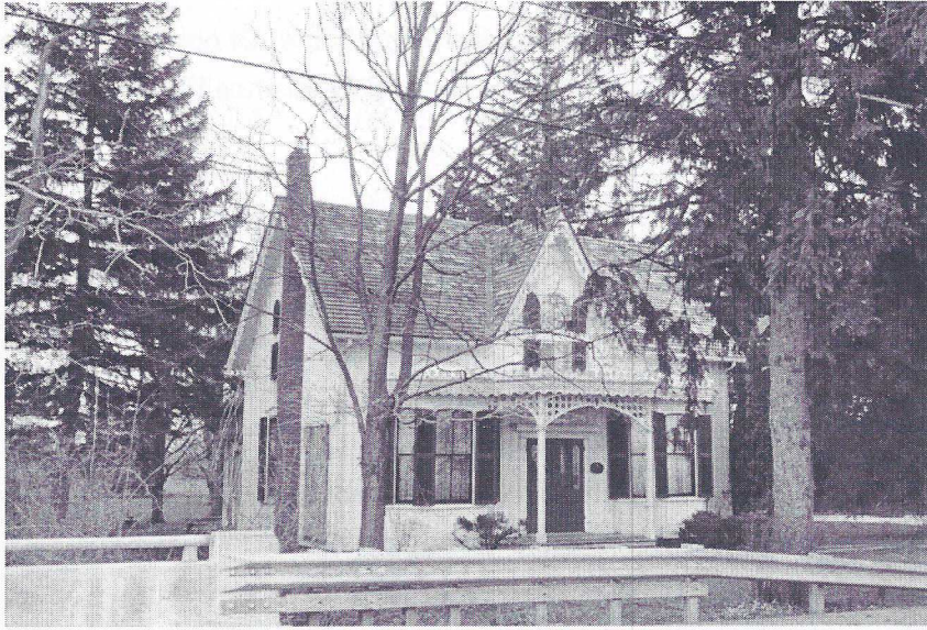
Erland Lee Museum