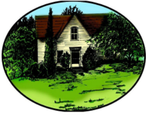
Remember the Corman House