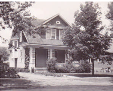
4 First Street, circa 1935