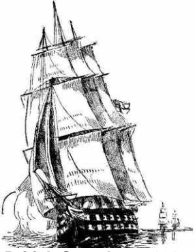
British Squadron - 1812