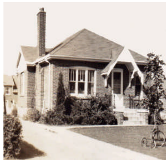
16 Wardrope Ave, Circa 1948