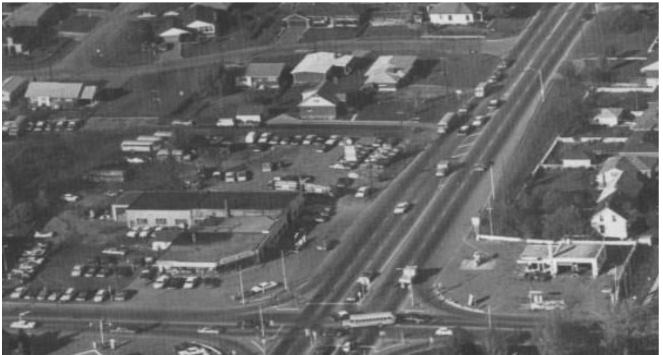
King St west and Centennial Pkwy aerial view of McLeod Motors Note: McLeod school buses parked where old house once stood.