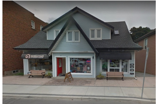
Moving McLeod's lunch room bldg. down King to its new location at 53 King St. East.