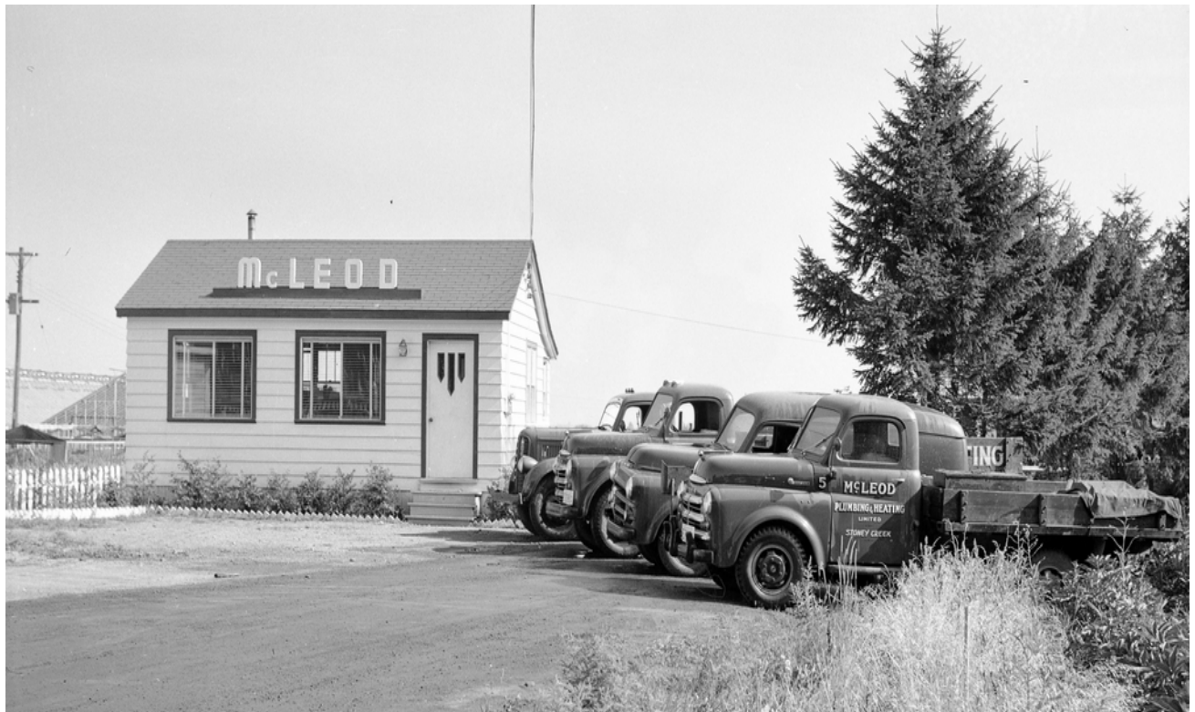
McLeod Plumbing |& Heating Limited stood a little further up King West and was run by brother Don McLeod. ( Note 4 trucks )