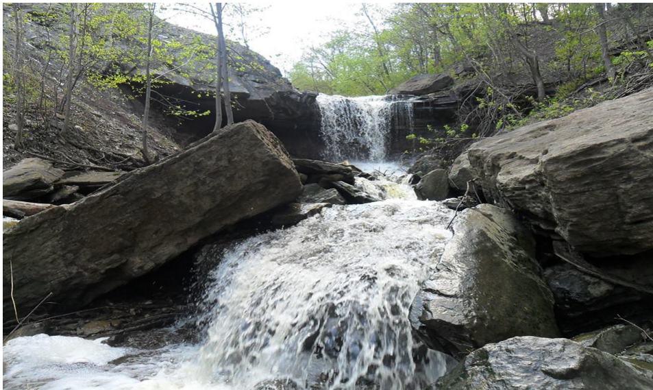
Lower Falls at the Devil's Punchbowl