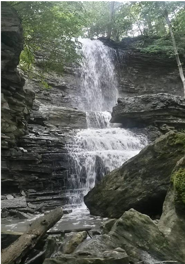
Billy Green Falls summer and winter