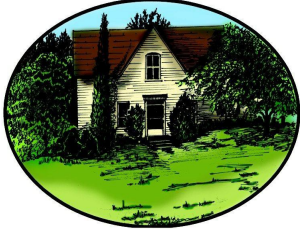
Remember the Corman House