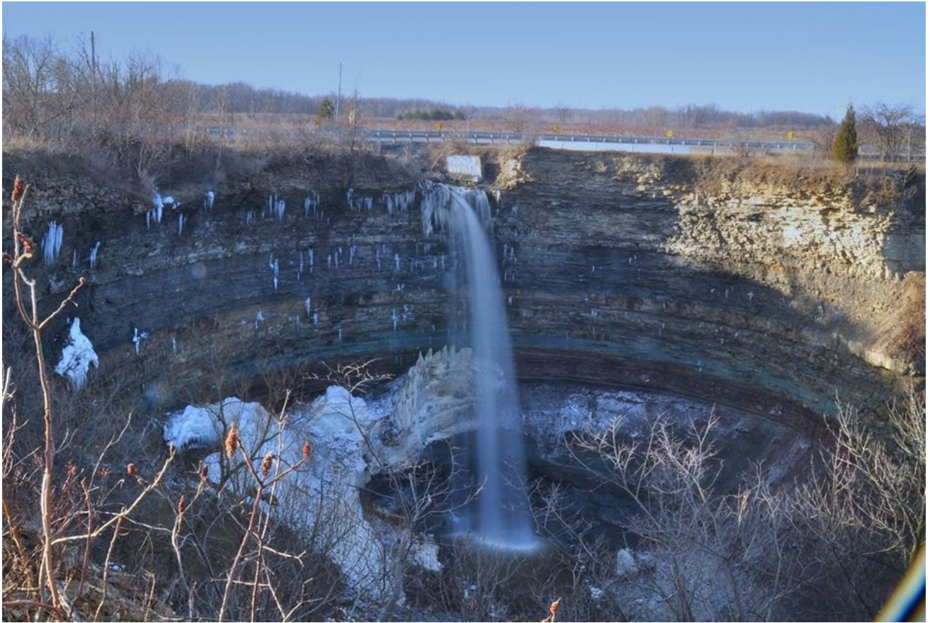
Devil's Punchbowl Falls last spring