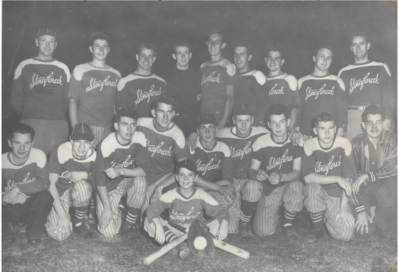
team won the Junior C Ontario championship. Members of the team pictured above, left to right

Win Title For Stoney Creek – knocking out Gravenhurst in the finals, the Stoney Creek softball