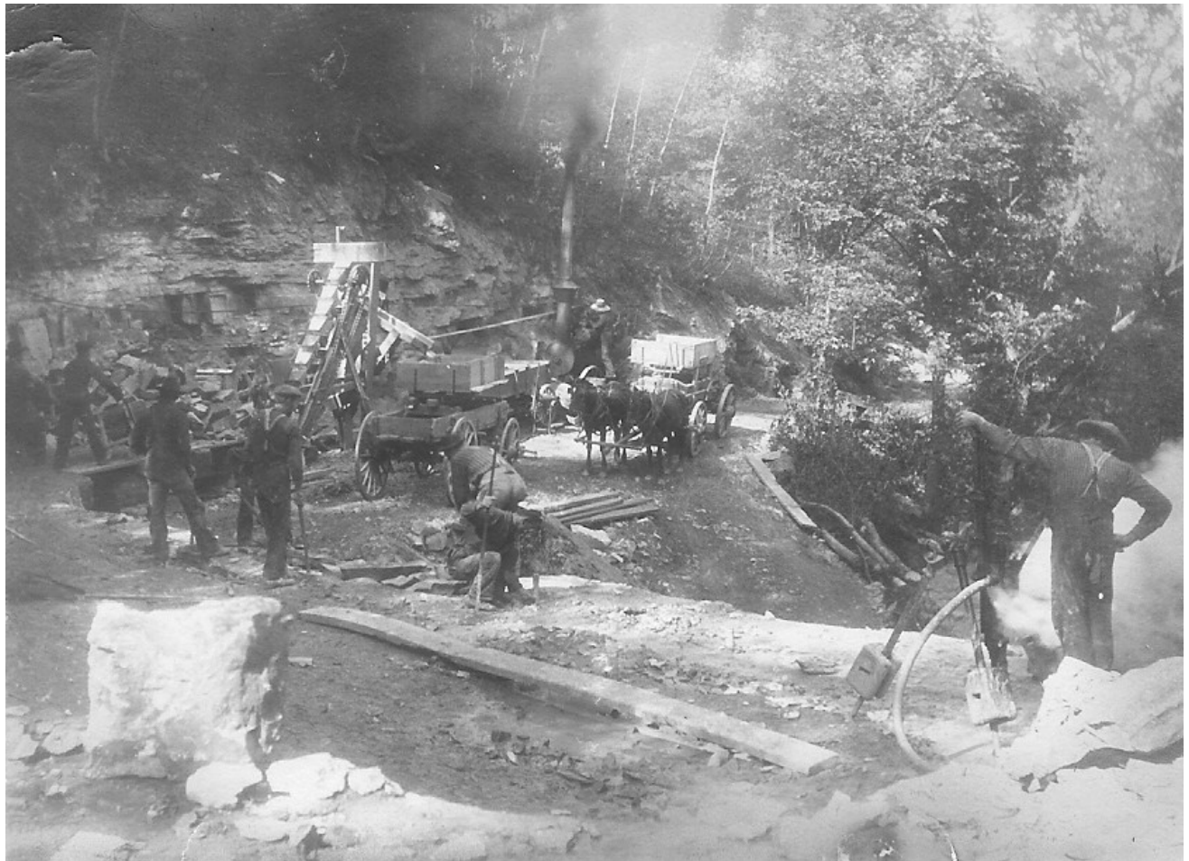
Pictured above 1902 W.E. Davis quarry located in the Devil's Punchbowl creek. Probably the location and creation of the lower punchbowl falls.